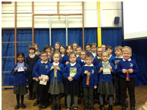
Bookmark competition winners